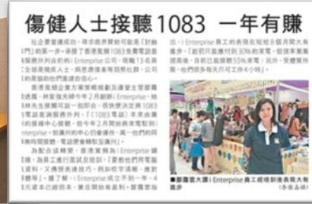
1083 telephone number enquiry service