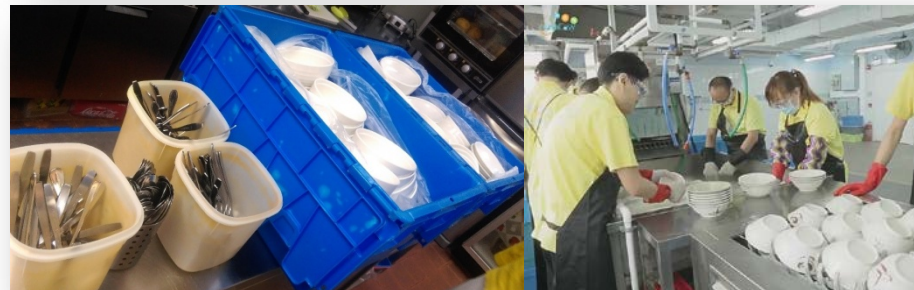
Canteen dishware cleaning service