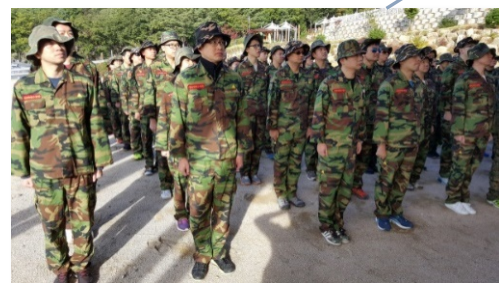
“Seoulmate” @South Korea