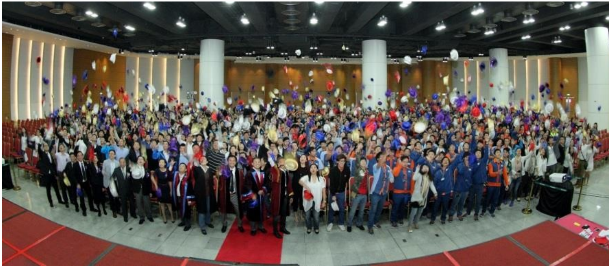
2,500 HKBNers came together to celebrate with NSU families for their graduation Nov 2014

38 students > 2,500 HKBN families > 2.5 mn Hong Kong households