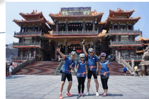
“Le Tour de Force” @Taiwan