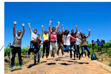
“Better Life” @South Africa